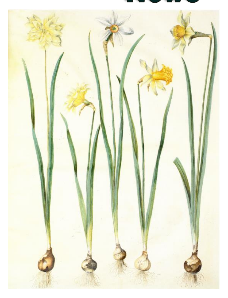
The Magazine of the Bride Valley Churches March 2017